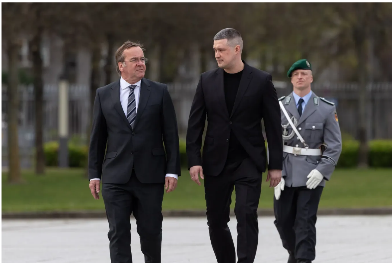
Mykhailo Fedorov and Boris Pistorius agreed on a new large-scale €4 billion defence cooperation package

Ukraine and Germany have concluded a package of defence agreements totalling €4 billion, focused on strengthening air defence, developing unmanned systems, and joint defence production.